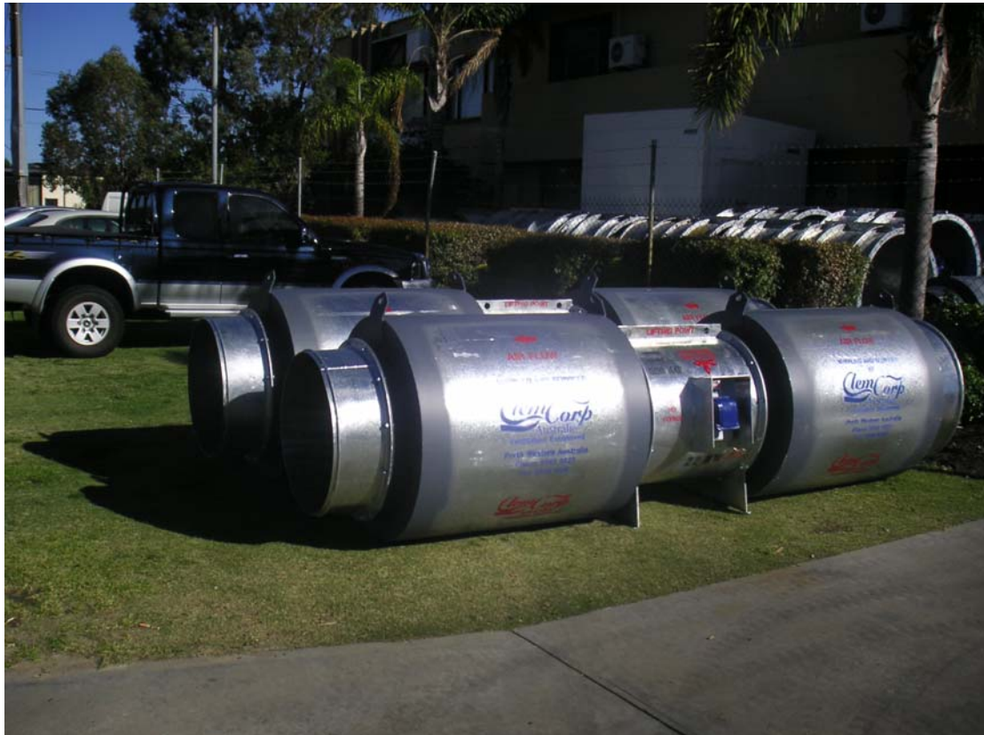
Figure 1 – CC760 1x22kW Single-Stage Axial Fan c/w Silencers, Inlet Cone and Duct Adapter

POWER: 1x37kW, 1x30kW, 1x22kW, 1x18.5kW, 1x15kW