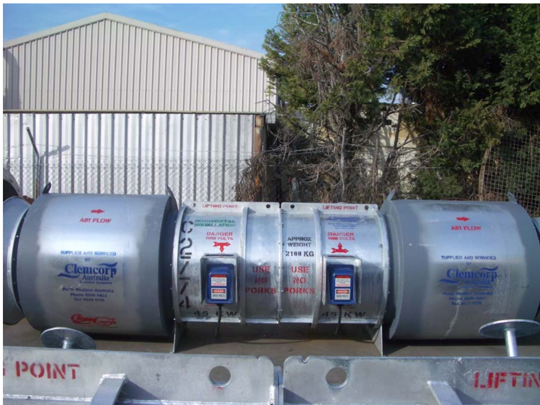
Figure 1 - CC1004 2x45kW Contra-Rotating Axial Fan c/w Pre-Terminated Leads, Silencers, Inlet Cone and Duct Adapter